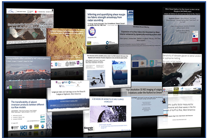
A variety of presentations from the BB meeting (part 1).