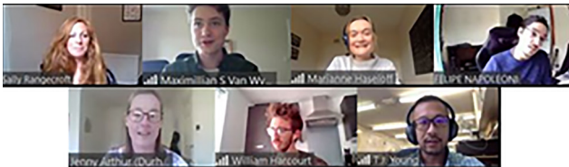
A small selection of the speakers during the meeting.

Further discussion and networking opportunities were delivered in the form of a 'speed-dating'